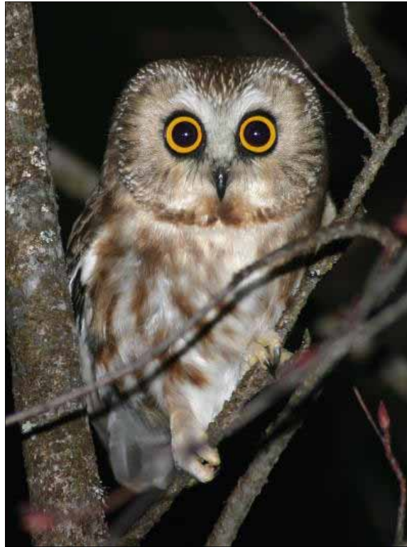
Northern Saw-whet Owl, Tower Mountain, Spokane, Spokane, 2/1/2005.

Mountain Chickadee Widespread reports of lingering birds from an irruption to lowland areas included 1 at Othello Adams from 12/1 to 2/28 (RH), 1 at Bainbridge Island Kitsap from 12/1 to 1/5, 1 near Port Gamble Kitsap from 12/1 to 2/28 (BWg), 2 at Big Lake Skagit from 12/1 to 2/28 (fide DiB), 1 at Bellevue King on 12/4 (fide TAv), 5 at Lyons Ferry Franklin from 12/4 to 2/28 (MD,MLD), 4 at Moses Lake Grant on 12/4 with 7 there on 2/1 (DSc), 1 at North Richland Benton from 12/9 to 2/6 (BW), 1 at Lacey Thurston on 12/11 (fide SM), 1 at White Salmon Klickitat on 12/14 (SJ), 1 at Washtucna Adams from 12/16 (RH) to 2/20 (CrC,JuC), 1 at West Seattle King on 12/16 (fide