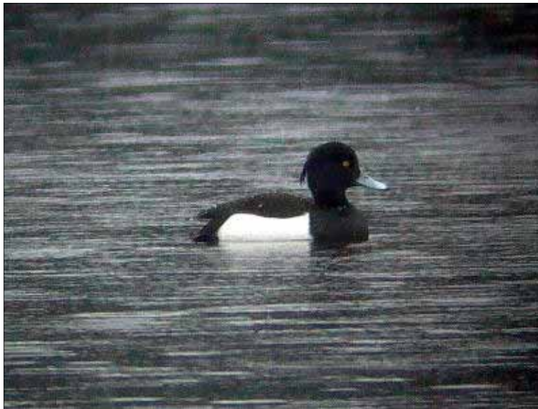
Tufted Duck, Phantom Lake, Bellevue, King, January 5, 2005.

American Bittern Rare in e WA in winter. 3 reported on the Toppenish CBC Yakima on 12/19 (fide DGr), 1 at Conboy Lake NWR Klickitat on 1/26 (JE), and 1 at Columbia NWR Grant on 2/4 (RH). Reports from w WA included 1 at Big Ditch Snobomish on 12/7 (MFM) with 2 there on 12/22 (RyM), 4 at Nisqually NWR Thurston on 12/9 with 1 there on 2/17 (PhK), 13 reported on the Grays Harbor CBC Grays Harbor on 12/26 (fide