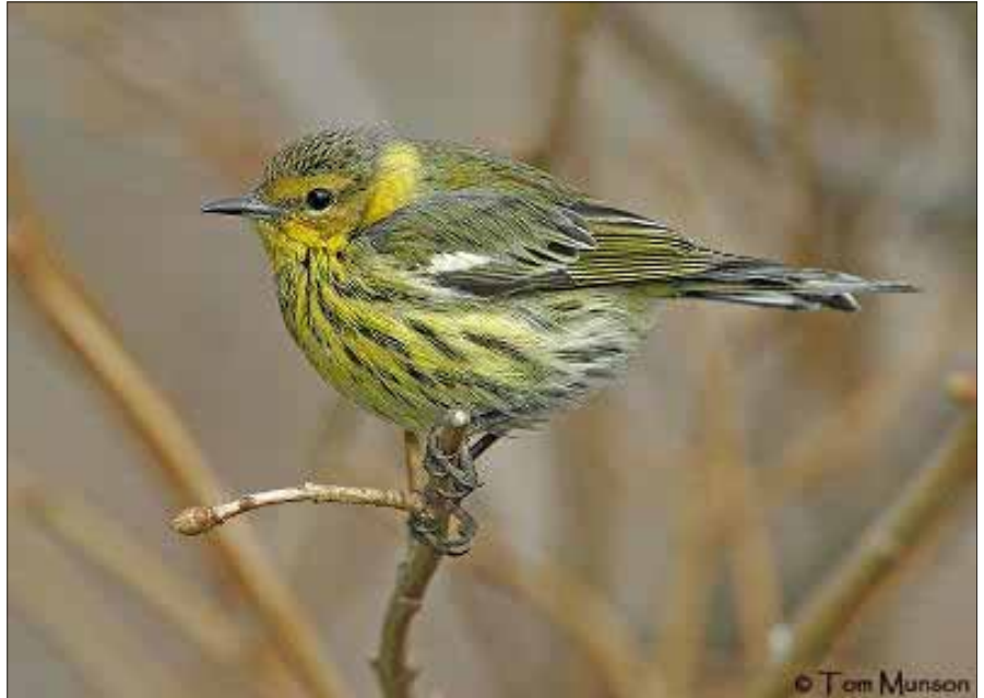
Cape May Warbler, Spokane, Spokane, February 7, 2005.

The Board has challenges ahead during the next year and I know that this group will continue to provide WOS with excellent advice and service.