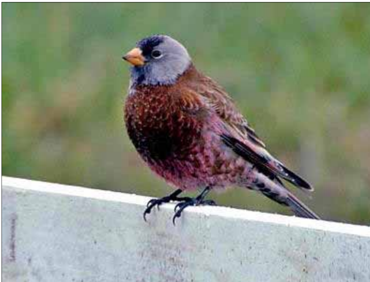
Gray-crowned Rosy Finch, Marrowstone Point Lighthouse, Ft. Flagler S.P., Jefferson, December 5, 2004.

Glaucous-winged Gull High count for e WA. 16 at Lower Monumental Dam Walla Walla on 1/22 (MD,MLD).