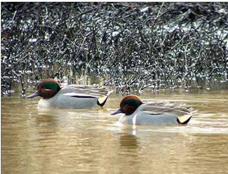
“Eurasian” (left) and “American” Green-winged Teal drakes, Bothel, King , January 27, 2005.

Trumpeter Swan Reports away from Skagit/Whatcom included 5 at Columbia NWR Grant from 12/1 to 12/31 (RH), 3 at Trout Lake Marsh Klickitat on 12/18 (CF) with 2 there on 12/21 (SJ), 2 at Kent King from 1/2 (JiF) to 2/8 (JGi), 44 south of Chiamacum Jefferson on 1/4 with 57 there on 1/21 (RR), 6 at Fort Canby SP Pacific on 1/9 (MPa), 13 at Duckabush Jefferson on 1/21, 4 at Quilcene Jefferson on 1/21 (RR), 8 at Juanita Bay King on 1/21 (MFM), 8 at Sequim Clallam on 1/22 (RR), 16 north of Raymond Pacific on 1/26 (TAv), and 31 at Crocker Lake Jefferson on 2/25 (RR). High count for WA: 1515 near Clear Lake Skagit on 2/15 (SM).