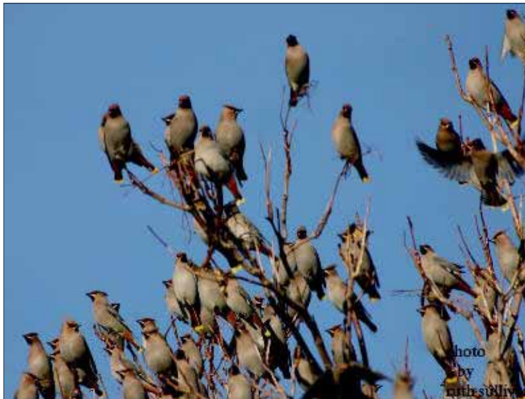
Bohemian Waxwings, Electric City, Grant , December 23, 2004

Marbled Godwit Reports included 2 at Port Townsend Jefferson on 12/16 (RSi), 4 near Stanwood Snobomish from 12/26 (SM) to 2/2 (TAv) with 2 there to 2/19 (fide SM), and 850 at Tokeland Pacific on 1/3 (CC) with 970 there on 1/26 (TAv).