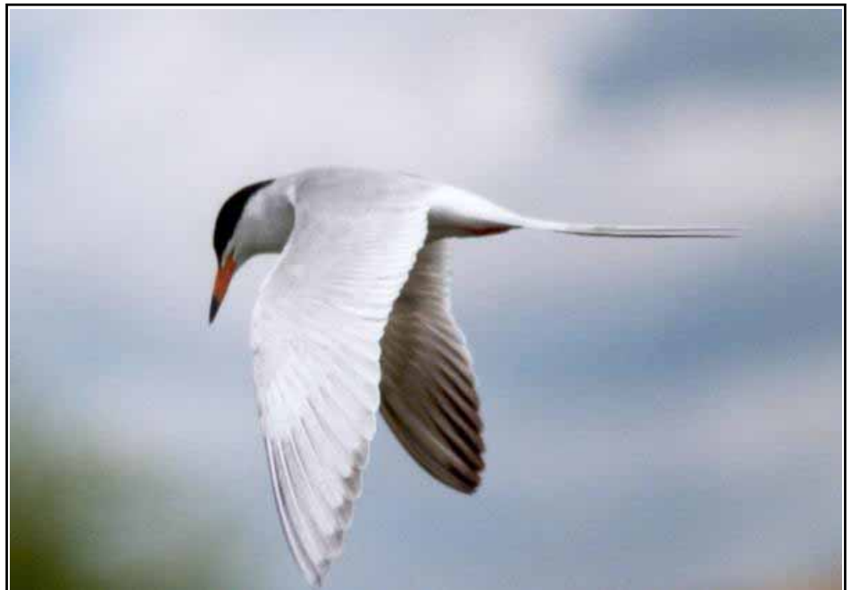
This beautiful shot of a Forster's Tern at Soda Lake, Potholes, 6/3/01, brings back memories of summer, even as winter darkness sets in around us.