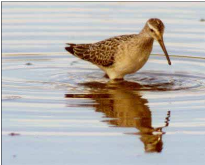
Ruth Sullivan photographed this Stilt Sandpiper on Brady Loop Rd., Grays Harbor , on September 3, 2000

Brown Pelican Reports include, 2 at Ediz Hook Clallam on 8/13 (BN), 300 at Ilwaco Pacific on 9/12 (BT), 1 at Kingston Kitsap on 9/15 (SA).