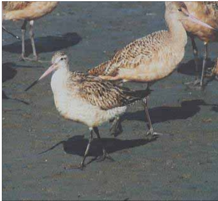
Ruth Sullivan found this Bar-tailed Godwit among numerous Marbled Godwit at Tokeland, Pacific , on September 24, 2000

Snowy Plover Reports include, 1 at Midway Beach Grays Harbor on 8/5 (EH), 22 at Oysterville Pacific on 8/11 (RS&PS), 4 at Long Beach Pacific on 8/15 (MD&MLD).