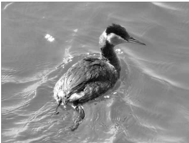
Red-necked Grebe, Blaine, Whatcom, April 1, 2008.

White-winged Scoter Rare in spring in e WA. 2 at Priest Rapids Yakima on 4/20 (AS).