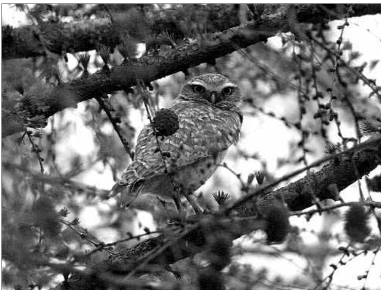
Burrowing Owl in a tree, Marymoor Park, Redmond, King. Photo by Ryan Merrill, April 10, 2008.

ASHY STORM-PETREL Rare in WA. 1 on the NOAA pelagic research trip off Grays Harbor