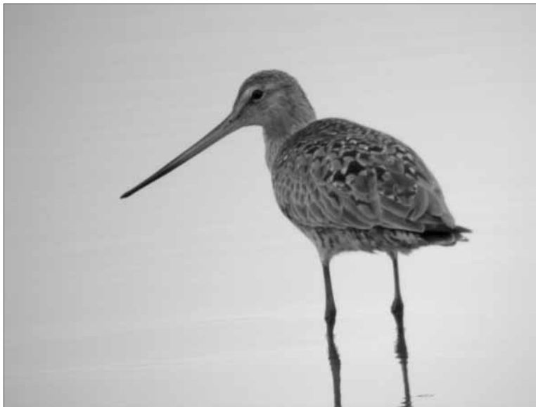
Hudsonian Godwit, Ocean Shores, Grays Harbor. Photo by Dale Arveson, May 26, 2008.

Pectoral Sandpiper Uncommon in spring in WA. 1 at Calispell Lake Pend Oreille on 5/16