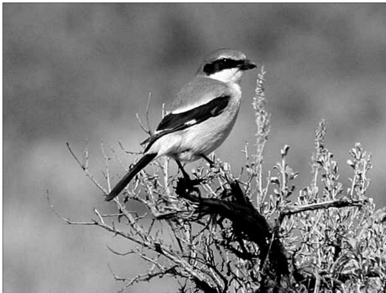
Loggerhead Shrike, Lower Crab Creek, Grant . Photo by Marv Breece, April 1, 2008.

Western Kingbird Reports for w WA included 1 at Kent King on 4/22 (fide TAv) with 3 there on 5/2 (MIH), 1 at Chehalis Valley Grays Harbor on 4/26 (RS) and 5/3 (RKO), 1 at Point Wilson Jefferson on 4/27 (fide TAv), 1 at Point No Point Kitsap on 4/27 (VN) with 3 on 5/11 and 48 there on 5/16 (BWg), 1 at Lake Sammamish King on 4/29 (ASc), 1 at Carnation King on 5/2 (MIH,MtB), 1 at Marymoor Park King on 5/3 and 5/23 (fide TAv), 1 at Boisfort Lewis on 5/3 (RKO), 1 at Scatter Creek Thurston on 5/3 (GW), 1 at Beaver Valley Jefferson