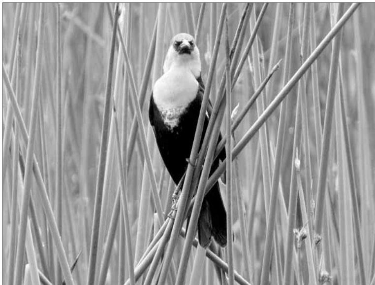
Male Yellow-headed Blackbird, Warm Beach, Stanwood, Snohomish . May 26, 2008.

Yellow-headed Blackbird Reports for w WA included 1 at Butler Flats Skagit on 3/1 (RyM,JBP) with 4 there on 4/27 (GB), 2 at Kent King on 3/11 (MaB,MtB), with 1 there to 4/20 (MiH), 1 at Warm Beach Snohomish on 3/19