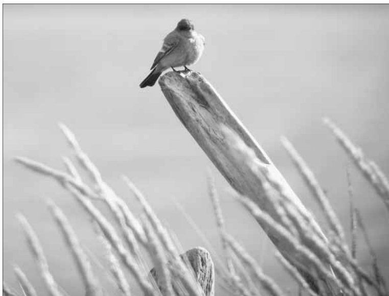
Say's Phoebe, West Point, Seattle, King. April 6, 2008.

Aratinga sp. Introduced population continues. 3 Mitred or Red-fronted Conure at Seward Park King on 3/15 (fide TA).