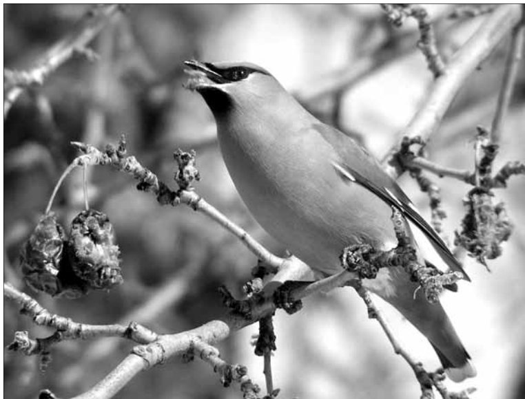
Bohemian Waxwing, Chesaw, Okanogan, March 2, 2008.

4/26 (RFI), 1 at Montlake Fill King on 4/26 (CSi), 1 at Fort Lewis Lewis on 4/26 (DDe), 3 at Nisqually NWR Thurston on 4/26 (KBd), 1 at Tenino Thurston on 4/26 (PH), 1 at Carnation King on 4/27 (CSc), 1 at West Seattle King on 4/27 (JiF), 1 at Point No Point Kitsap on 4/27 (VN) and 4/30 (BWg), 2 at Alderton Pierce on 4/27, 1 at South Prairie Pierce on 4/28 (CWr), 2 at Marymoor Park King on 4/29 (MiH), 1 at Seattle King on 4/29 (ST) and 5/1 (ENe), 2 at Bayview Skagit on 4/29 (JBP) with 1 there on 5/10 (KKc), 1 at Juanita Bay King from 5/1 to 5/11 (RyM) and 5/30 (TaB), 1 at Renton King on 5/1 (GuM), 1 at Bainbridge Island Kitsap on 5/1 (BWg), 1 at Skagit WMA Skagit on 5/1 (JBP), 1 at Maury Island King on 5/2 (ESw), 2 at Ridgefield NWR Clark on 5/3 (RFI) with 1 there on 5/11 (KK), 2 at Maple Valley King on 5/3 (DSw), 2 at